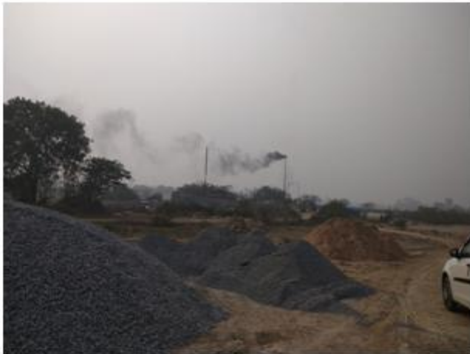
Unnao STP Site