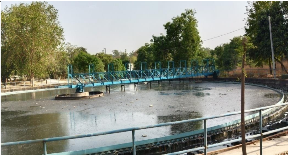
130 MLD Jajmau STP