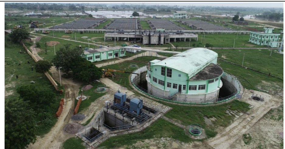
Bingawan 210 MLD UASB STP