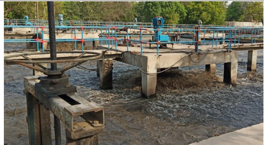
130 MLD Jajmau STP