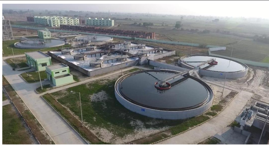
Sajari 42 MLD STP (ASP)