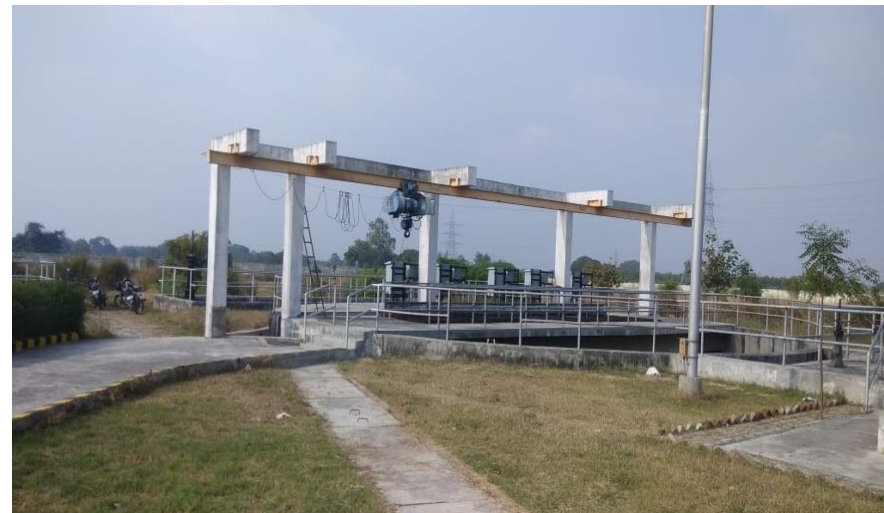
43 MLD Sajari STP visit