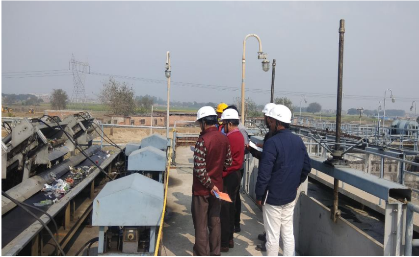
Bingawan STP visit