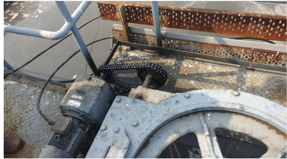
Bingawan STP visit