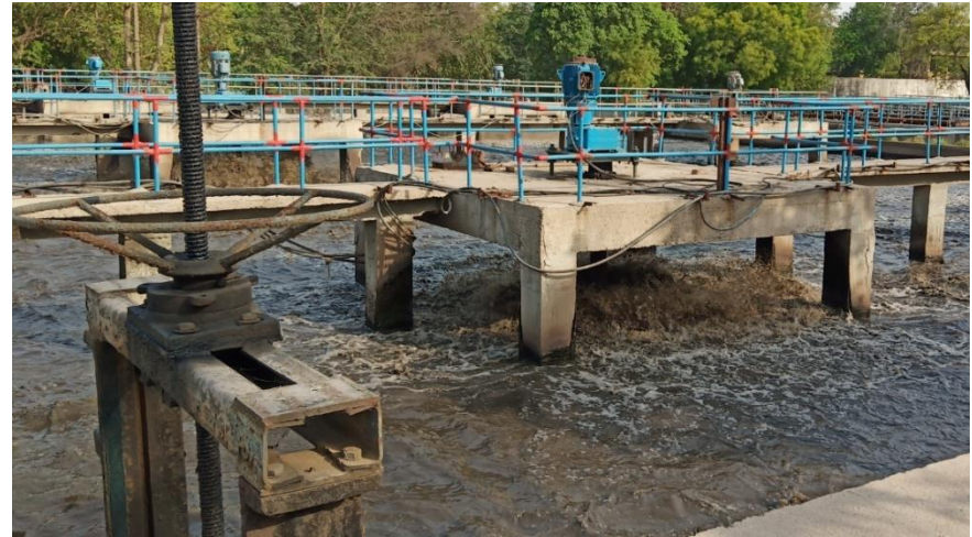
130 MLD Jajmau STP