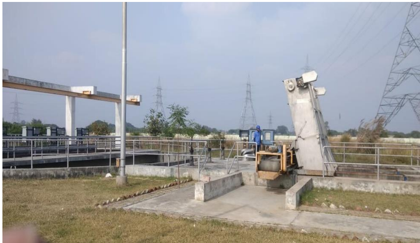
43 MLD Sajari STP visit