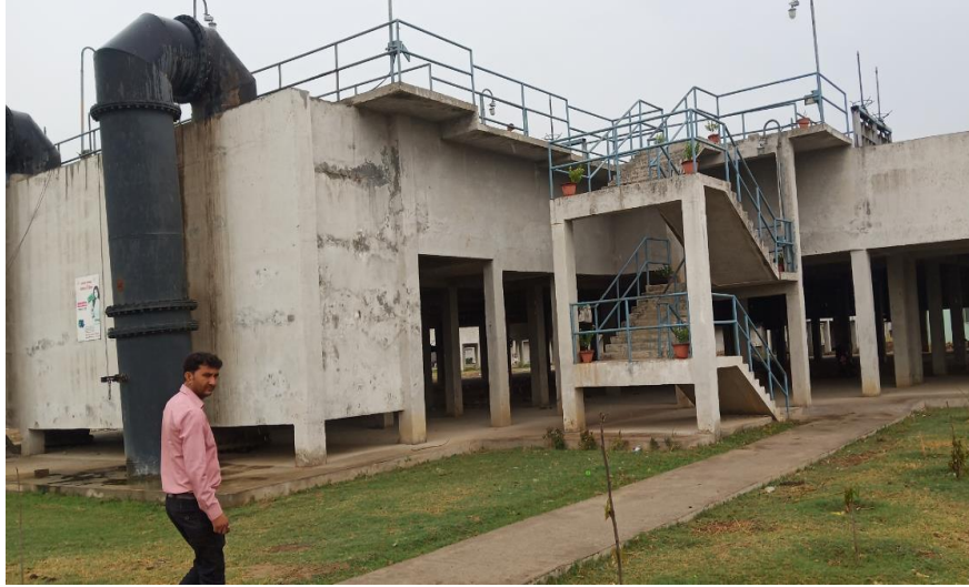
210 MLD Bingawan