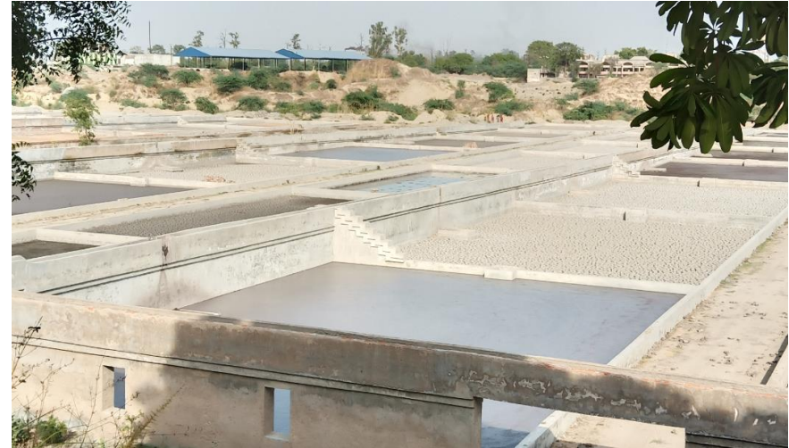
130 MLD Jajmau (Sludge Drying)