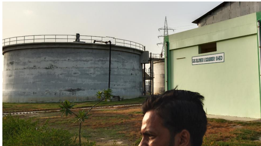
Sajari STP (Gas Blower)