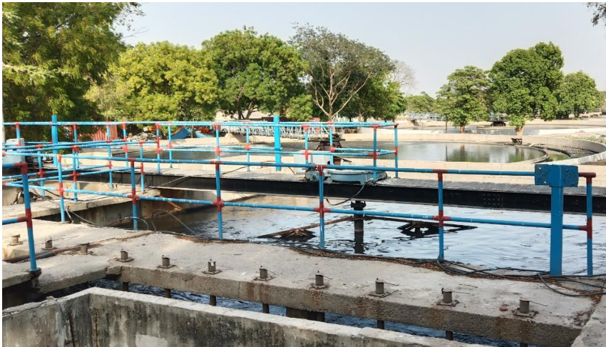
130 MLD Jajmau