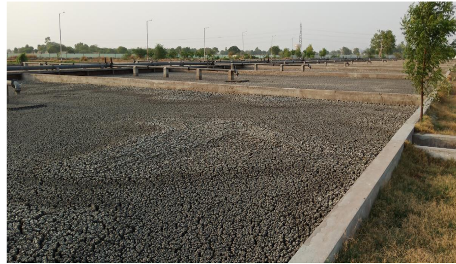
Sajari STP (Sludge Drying Bed)