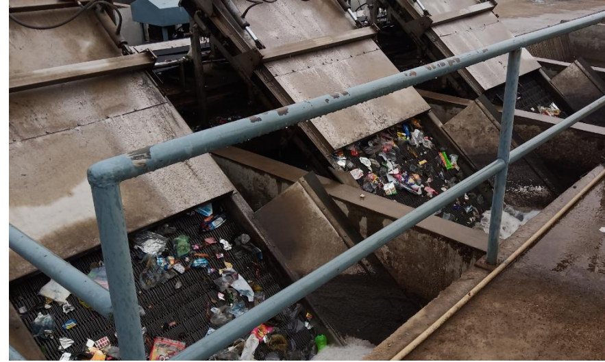
210 MLD Bingawan