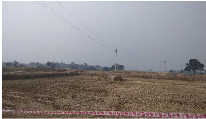
Pankha STP Site