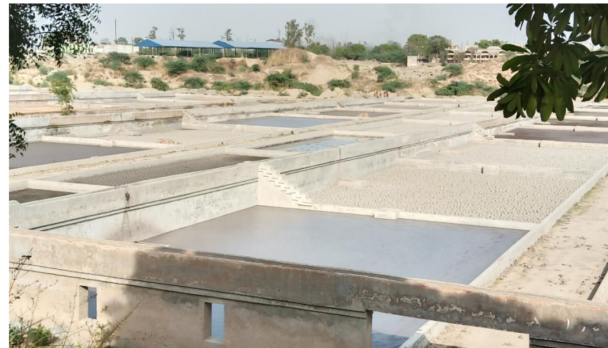
130 MLD Jajmau (Sludge Drying)