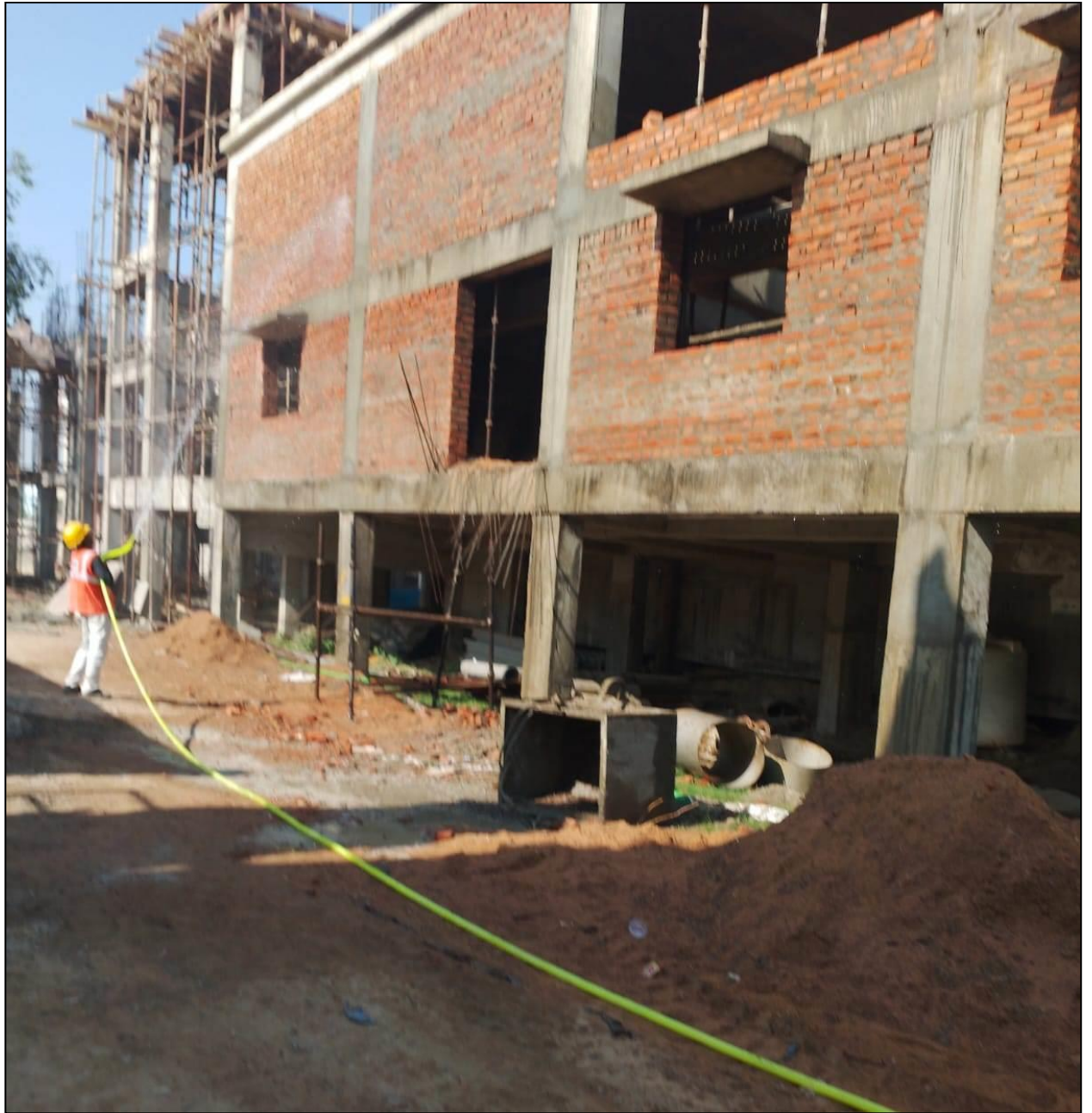
D. Staff quarter- Electric work, plumbing, sanitary fittings, floor, roof treatment, drainage, finishing and painting works are pending.