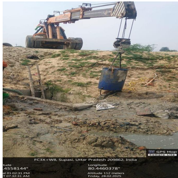
Dewatering and desilting work at MH 36-37 & Desilting work at MH 38