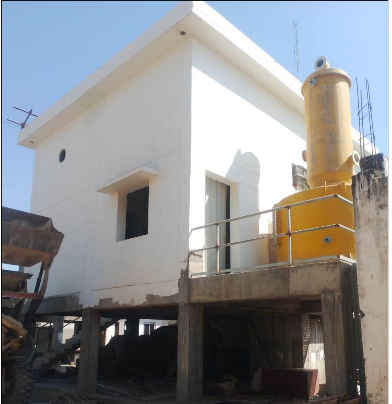
H. Sludge Thickner & Supernatant Pump- finishing, painting and hydro testing are pending. Scraper is installed.