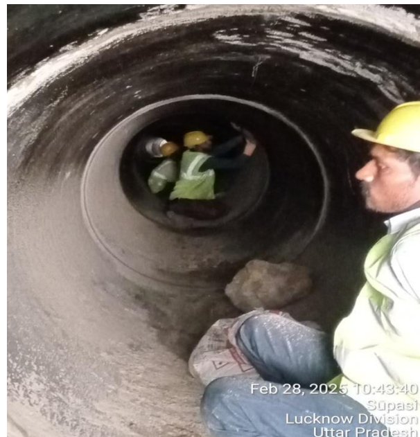
Desilting work at MH-14 & Jointing work